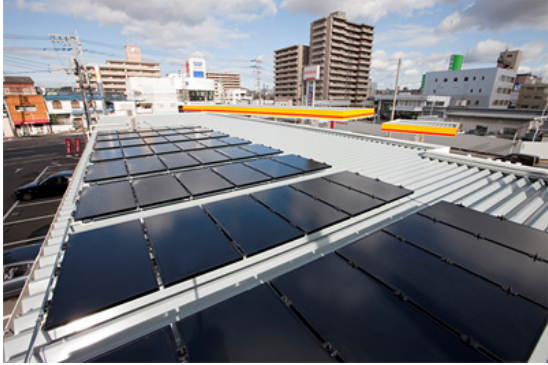
Energy Conservation In case of Emergency, Life-line Support SS