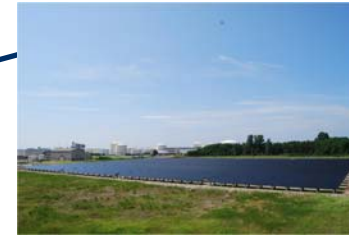
Mega Solar GPPS