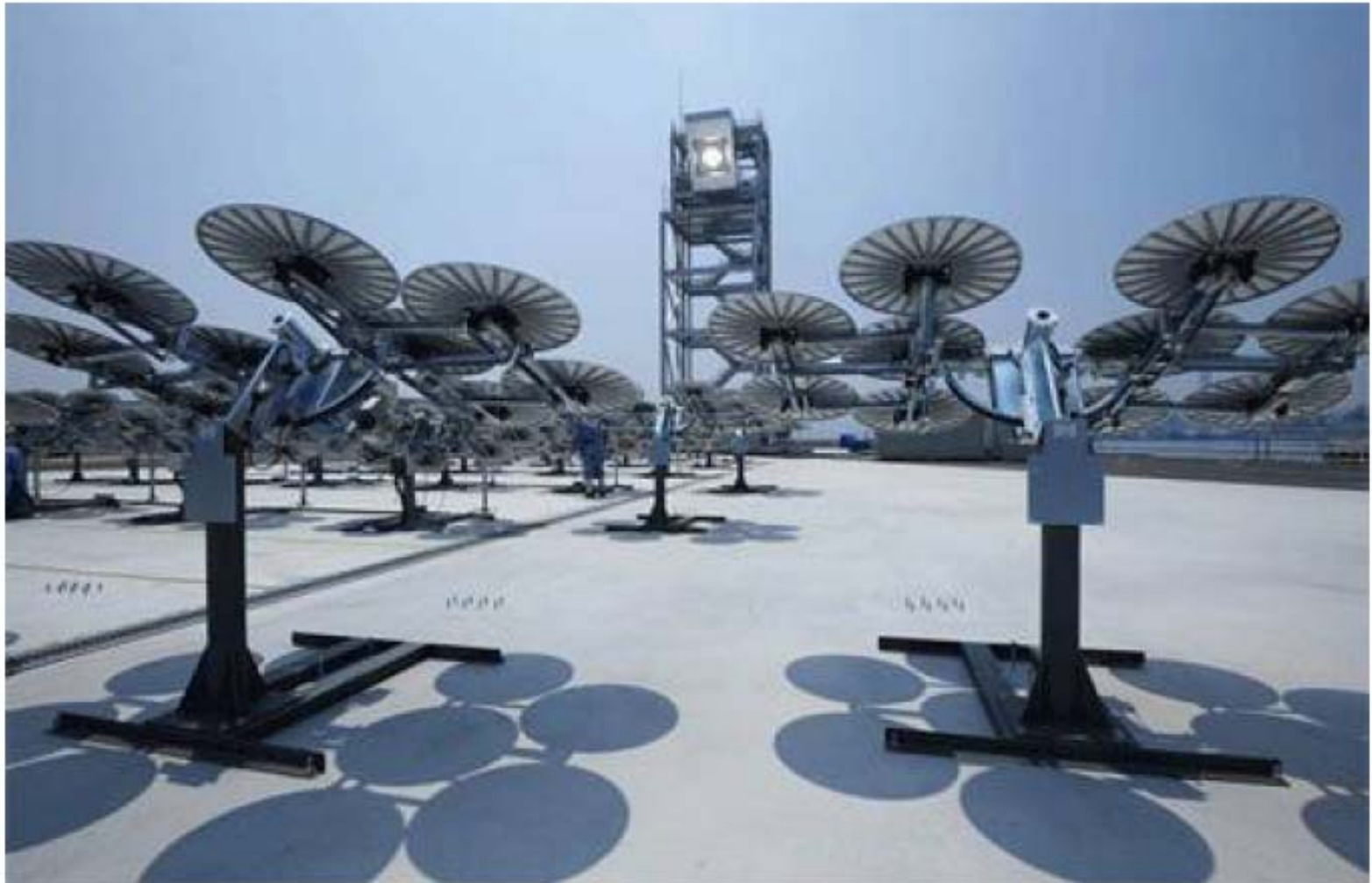
[Reference] Comparison of tower CPV and conventional solar power generation