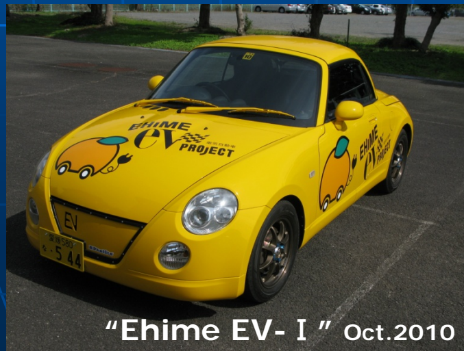
"Ehime EV-1" Oct.2010