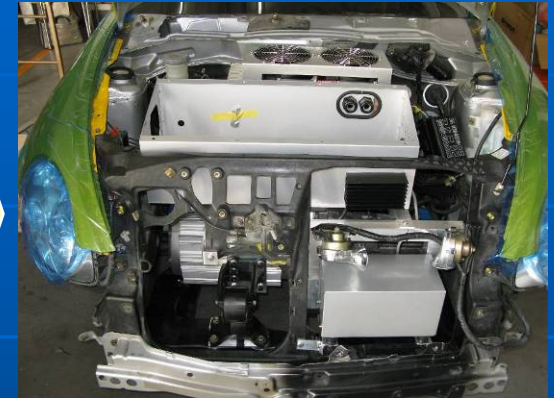
Assembly of motor etc