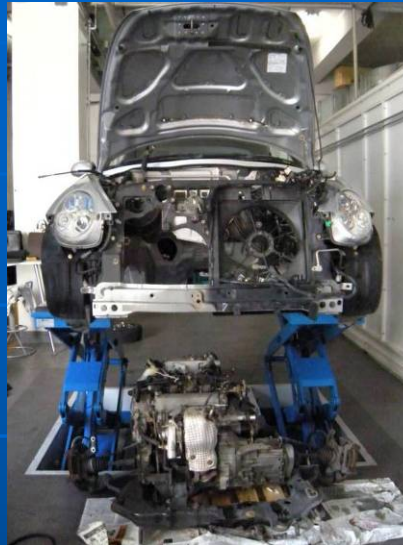
Dismounting of engine