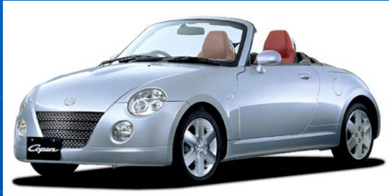
Based Car: Small Engine Car "DAIHATSU Copen"